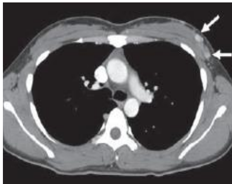
Fig. 2. Contrast-enhanced CT image of chest shows nodular areas (arrows) of rapid contrast enhancement in left breast, corresponding to ACC.