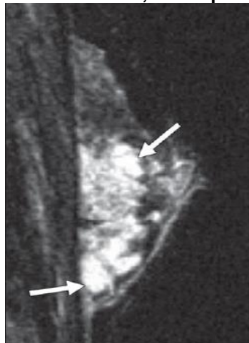
Fig. 3. Fat-saturated, sagittal, T2-weighted MR image of left breast shows areas of hyperintense T2 signal within mass (arrows)